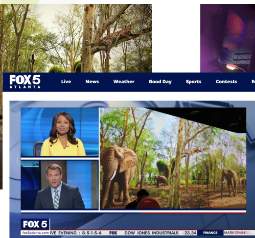
First look inside Illuminarium Atlanta